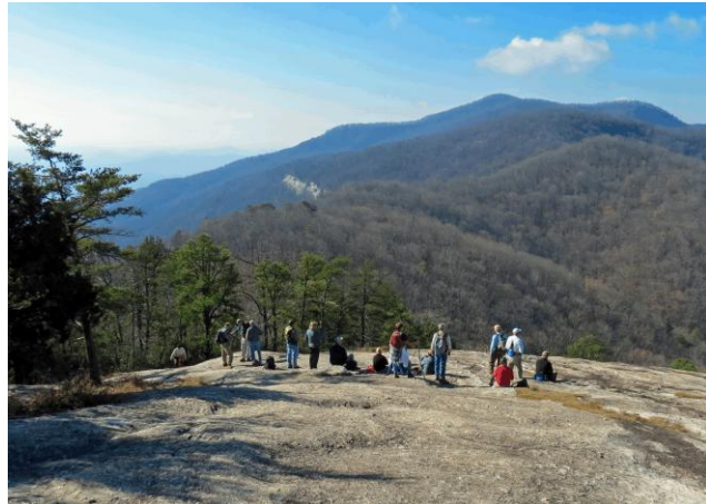
TABLE ROCK in TABLE ROCK STATE PARK

DESCRIPTION: Table Rock, a National Recreation Trail, accesses the imposing granite dome of Table Rock Mountain. The red-blazed trail begins at the park's Nature Center, winds briefly among nice waterfalls along the paved Carrick Creek Trail, then splits right and climbs over 2000 ft to Table Rock summit at 3,157 ft. The trail and steps are rocky passing through open forest and dramatic boulder fields.. Spectacular views from Governor's Rock to the west and from Table Rock cliff to the east...where legend says errant Indians were thrown to their death...make this difficult hike worth the effort. There are places to rest along the way including a shelter and overlook about half way up. We lunch on the cliff beyond the summit. The 7.4 mile hike is out and back, so bail out is an option.